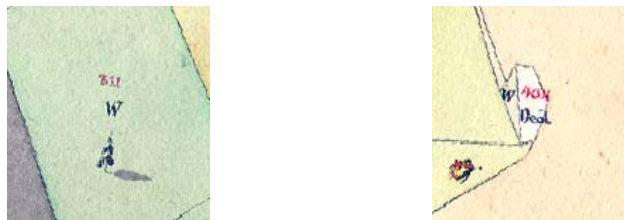
Figure 1 An example of pasture and barren land symbol on the original map of SC

Beside that the crucial point of this stage is acquiring the original map legend which gives us a contemporary meaning of the map symbols. As in the case of Stabile Cadastre most of the antique maps use symbols which are either still used in modern maps or can be deciphered intuitively (e.g. greenish trees = a forest), so we can in some cases work without the legend. There is of course impossible to achieve much detailed interpretation without the risk of mistake. If we possess the original legend 2 we can either follow the categories in full or join some of them and thus simplify the legend according to our needs but all the time making sure that any of important data will not be lost in the process.